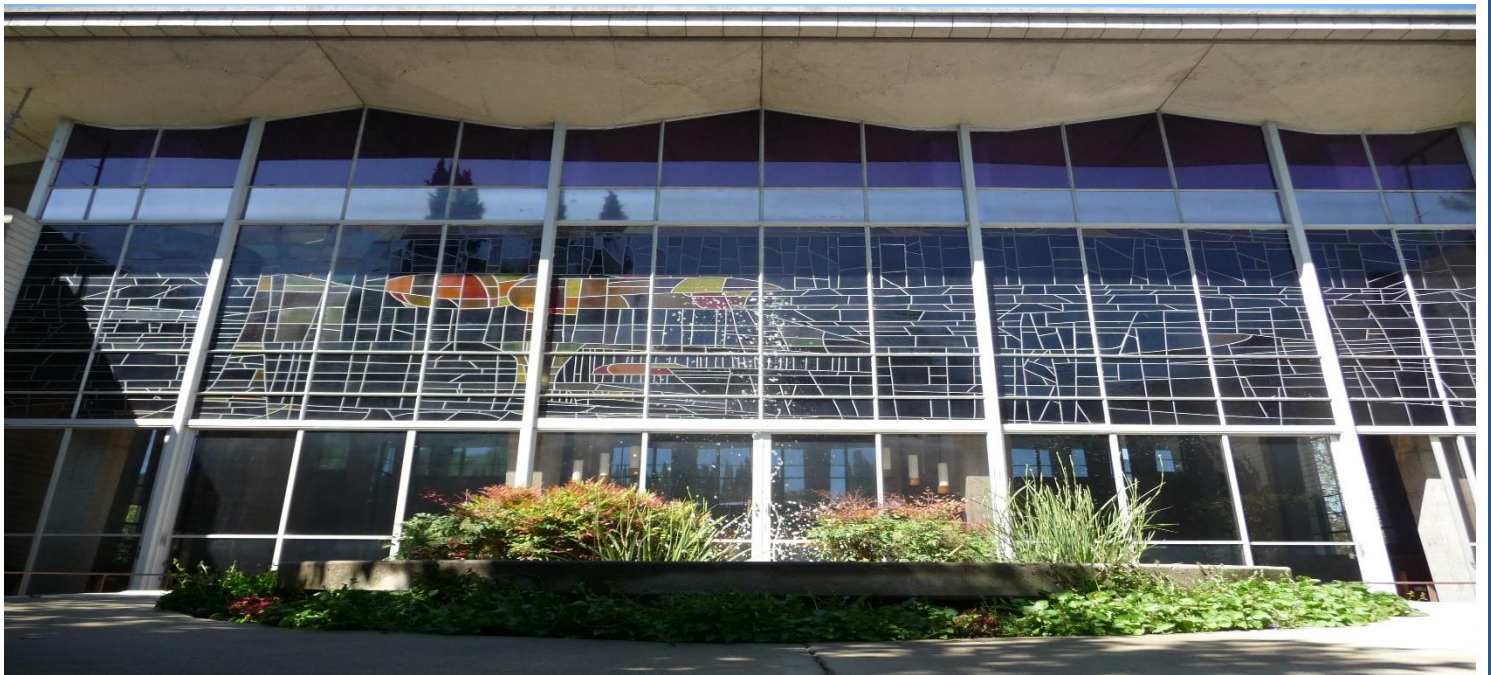
Prayer Garden and Stained Glass Windows at St. Matthew's UMC