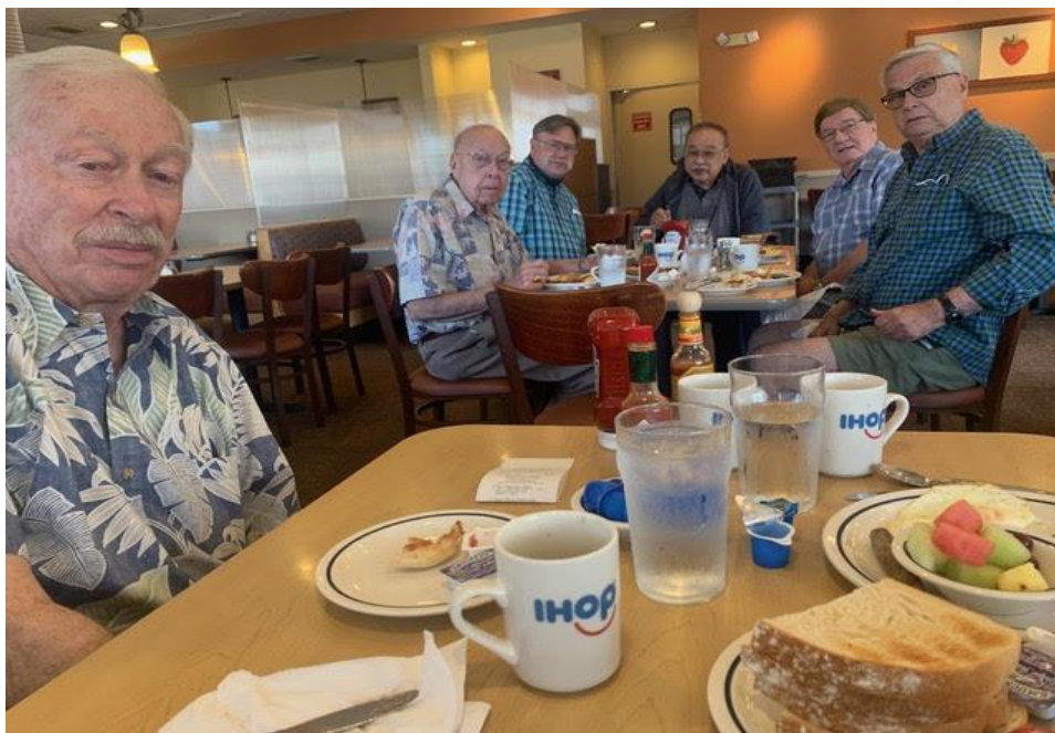
Men's Breakfast June 24 th