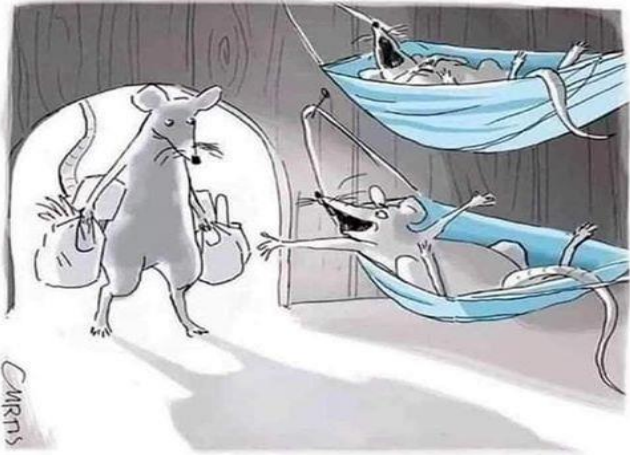
"FREE HAMMOCKS, all over town. It's like a miracle!"